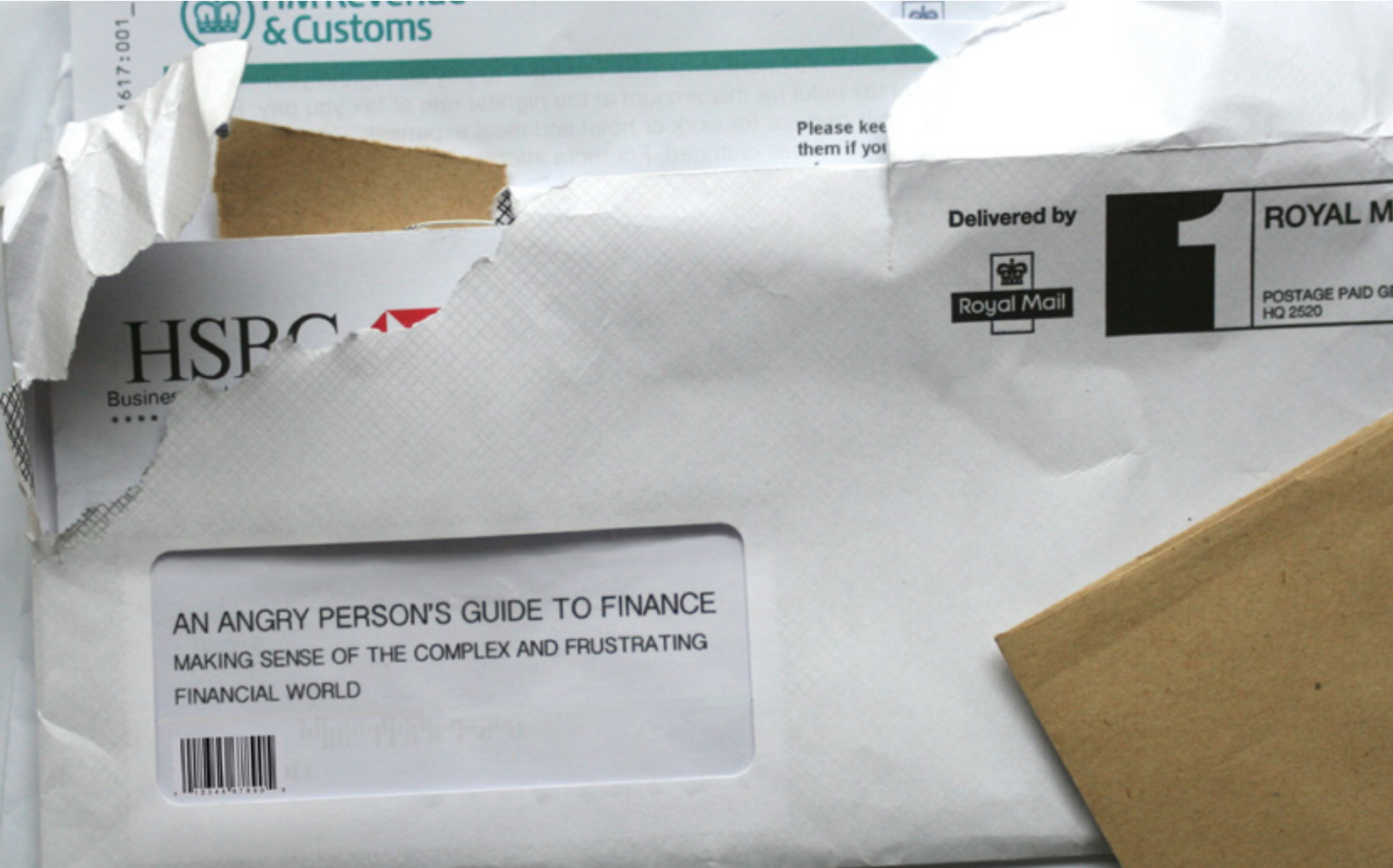
A red pepper pamphlet by Jack Copley